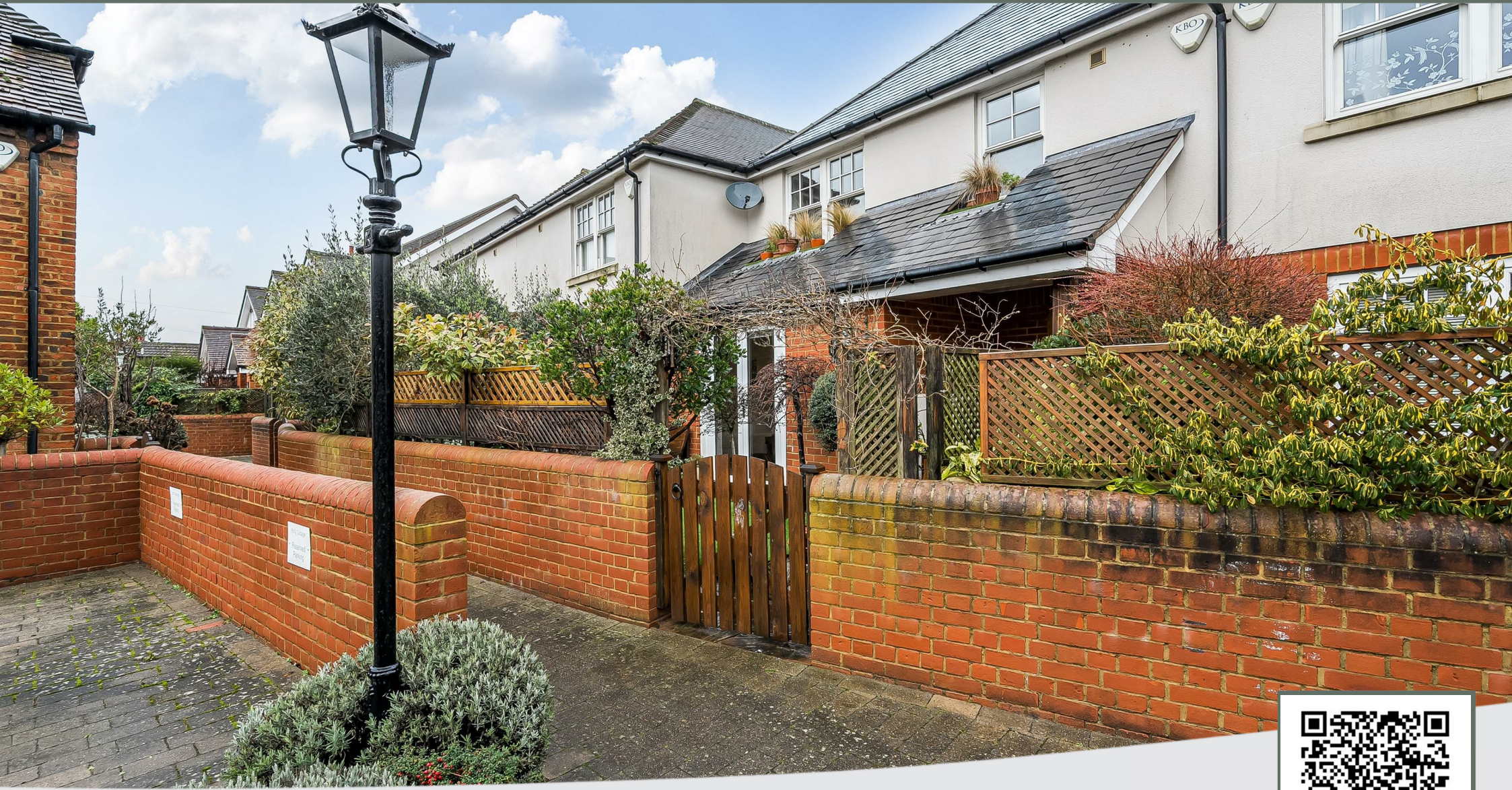
Ash Cottage, 2 The Courtyard, High Street Ripley, Surrey, GU23 6BQ